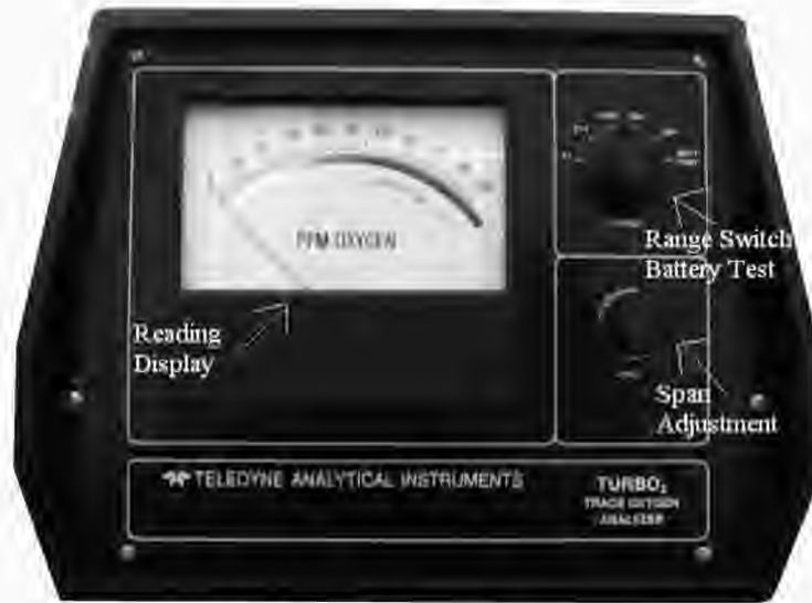
Figure 1: Front Panel