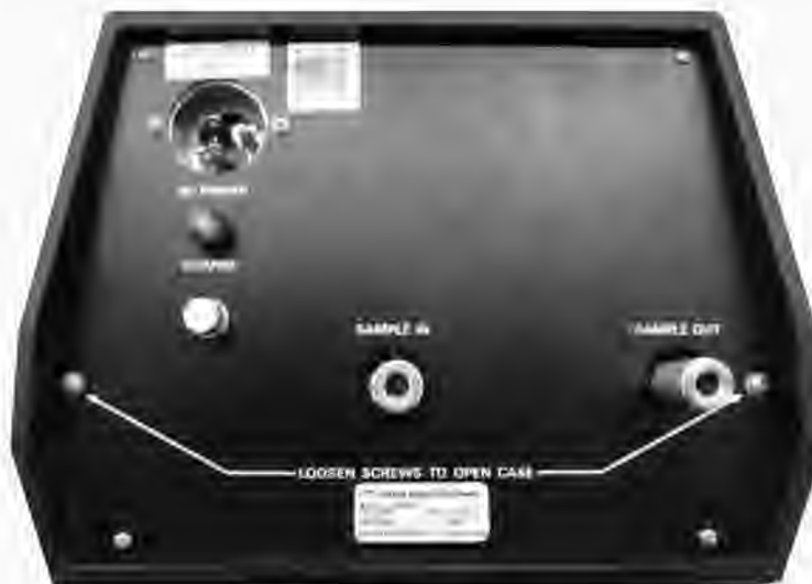
Figure 2: Rear Panel